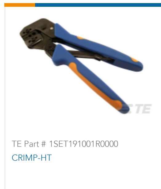
TE Part # 1SET191001R0000 CRIMP-HT