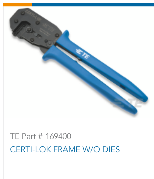
TE Part # 169400 CERTI-LOK FRAME W/O DIES