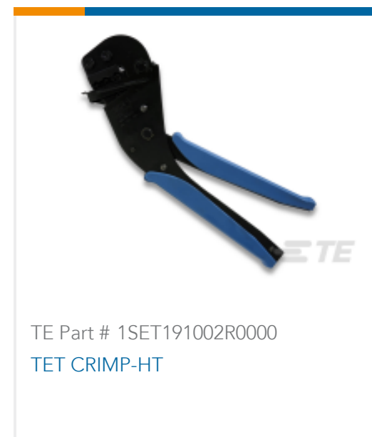
TE Part # 1SET191002R0000 TET CRIMP-HT