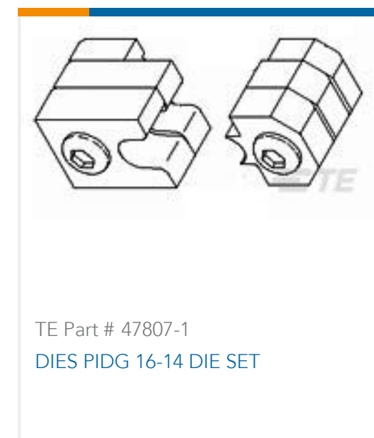
TE Part # 47807-1 DIES PIDG 16-14 DIE SET