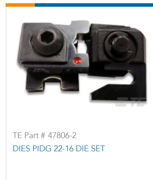
TE Part # 47806-2 DIES PIDG 22-16 DIE SET