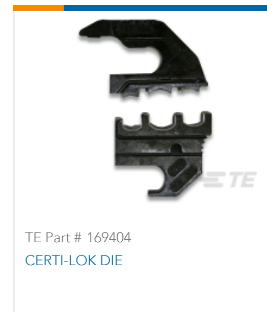
TE Part # 169404 CERTI-LOK DIE