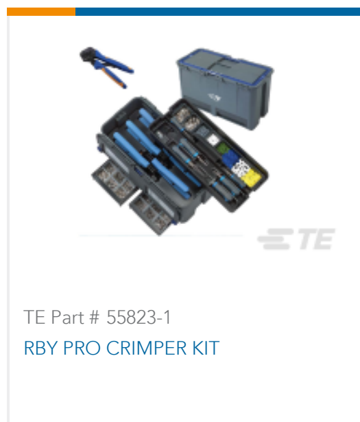
TE Part # 55823-1 RBY PRO CRIMPER KIT