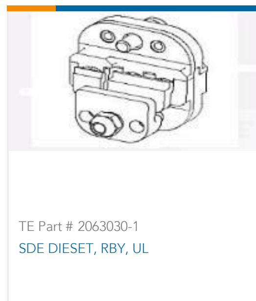
TE Part # 2063030-1 SDE DIESET, RBY, UL